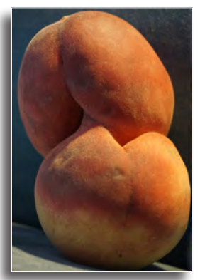
Siamese Twin Peaches